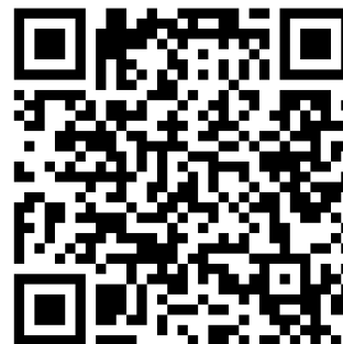
NX BUS JOURNEY PLANNER