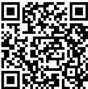
MOOVIT JOURNEY PLANNER

We strongly advise that students know how to get to school and return home via an alternative bus service, should any of the dedicated buses not arrive.